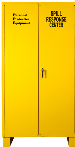
PPE & Spill Control Storage