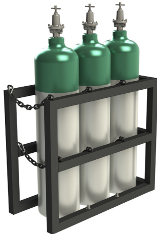
Gas Cylinder Racks